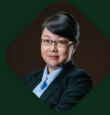
Cherry Co Founder & Risk Advisor