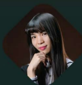
Feihu Lead Smart Contract Developer