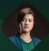
Venk The Last Thieves Music Producer