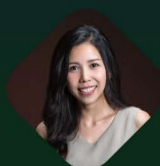
Zyng Art Director